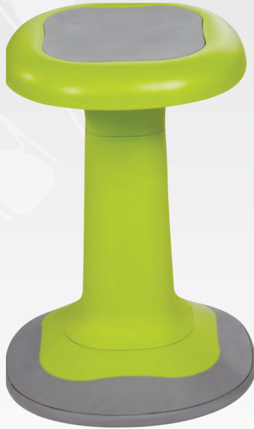
SQ-18 - Active Seating Stool

Waterfall Edge Seat Doubles as Grab Handle