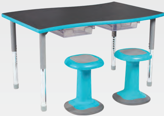
SQ-18 & HS-3152CD - Active Seating Stool & Harmony Chord Table (Shown with custom Gray Graphite Chem Res HPL)