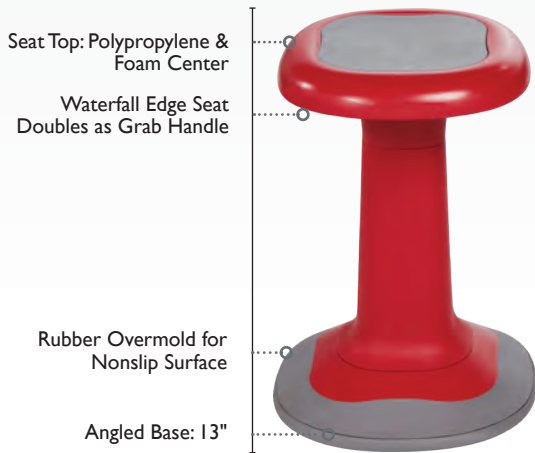
SQ-18 - Active Seating Stool