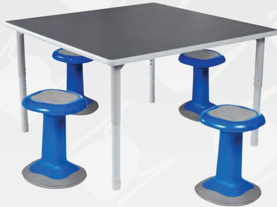
SQ-18 & HL-4848SQ - Active Seating Stool & Hercules Square Table (Shown with custom Gray Graphite Chem Res HPL and X-Strong Edge)